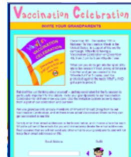
Invitations for Grandparents