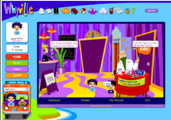
Flu Shots at City Hall