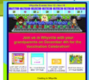
Promoting the 'Vaccination Celebration'